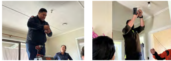
Ngā Kaimahi Taiwhenua installing new smoke alarms