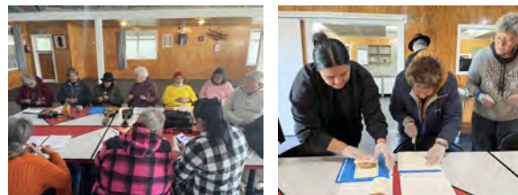
Ngā Pakeke o Ngā Taonga o Matakāoa