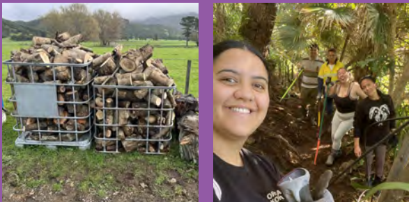
Ngā Kaimahi o Manaaki Matakāoa